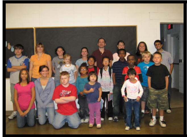
New students and staff

MDS has 18 new students and 11 new staff. MDS has 68 students and 46 staff in total. MDS is thrilled that they joined our school!