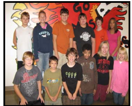
Students create The Blazers Times!