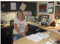
Working away the day!!

As you can see by reading this newsletter, we are off to a great start to the 2008-2009 school year! We have had a very large influx of new students enrolling since summer! We hope to host a "New Families to MDS Night" sometime soon (Oct) as we want to formally welcome all of them to our MDS Community. The